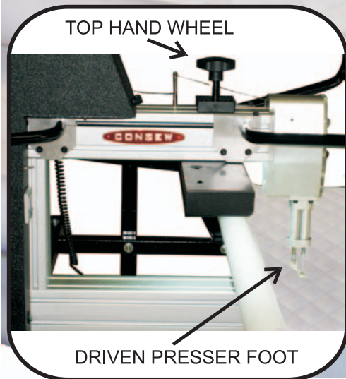
TOP HAND WHEEL