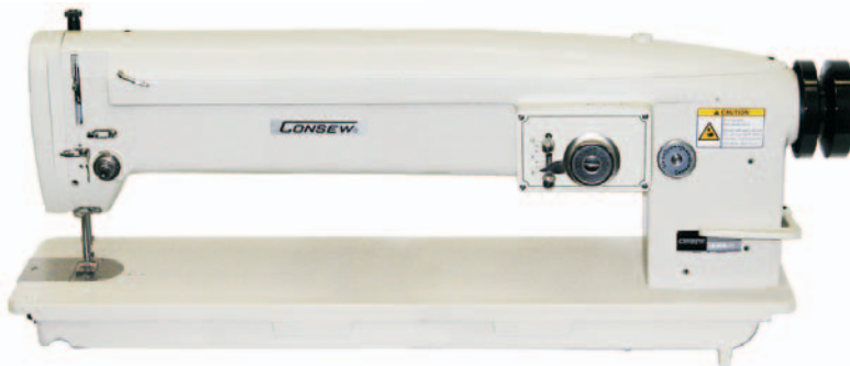
199RBL-1A Special order (1A, 2A, 3A) Long arm with up to 30" work space