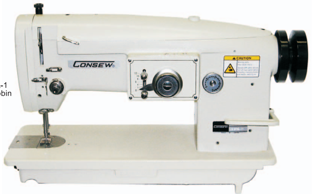
199RB-1A-1 Large Bobbin

COMBINATION ZIG-ZAG AND STRAIGHT STITCHER