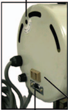
Adjustable Rotation (Forward/Reverse) Built-in 6v Light Socket