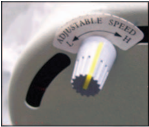
Adjustable Speed (0 - 3450 r.p.m.)