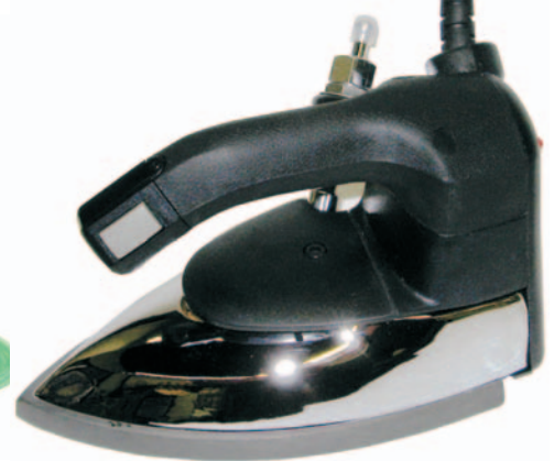
Teflon Shoe, Water Bottle with Filter, Hose & Stand